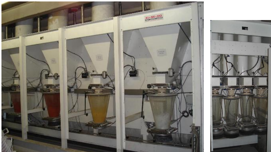
PF 6 and PF 4 S for paper sack charging with bucket conveyor for the discharge onto the moving bucket scale for aggregates