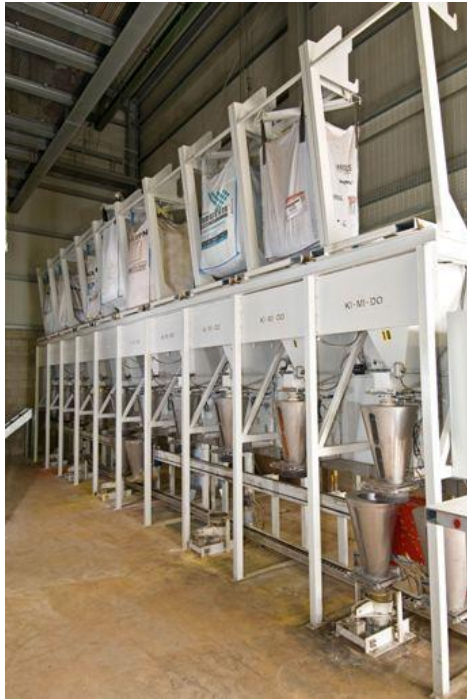
PFW 10 with 2 bucket conveyors for the discharge onto 7 down pipes for delivery onto 7 skip hoists (down pipes swing able and additional storage possibility)