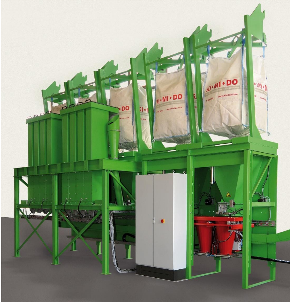
PFW 15 with bucket conveyor in double line

The above shown customized dosing machine for powder PFW 15 has in total 15 dosing stations, thereof