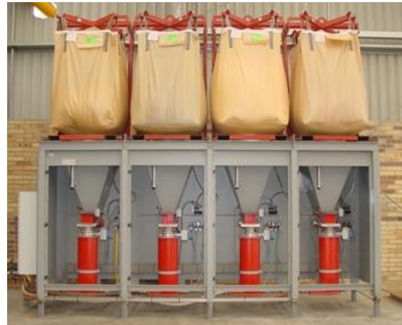
PFD 4 WS