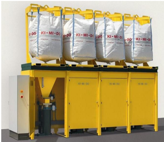
PFD 4 WS