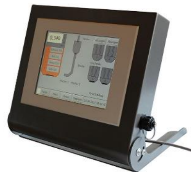
Control system DS 5 touch