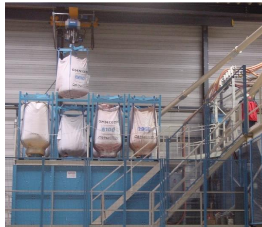
2 x PFD 4 WS for 2 mixers