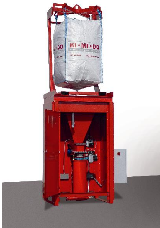
Basic colour module PFD 1 WS