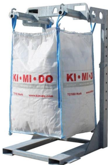
Height adjustable Big-Bag-steel rack with lifting hook