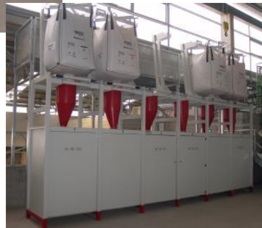
FD 6 WS with Big-Bag-steel racks and lifting hooks