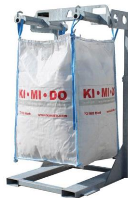
Height adjustable Big-Bag-steel rack