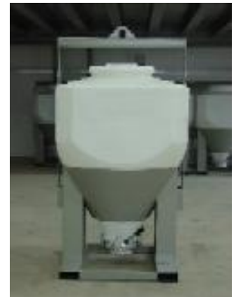
Changeable PVC-silo 1,2 m 3