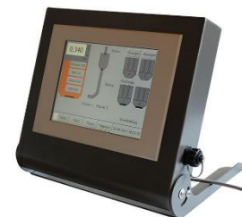
Control system DS 4 touch