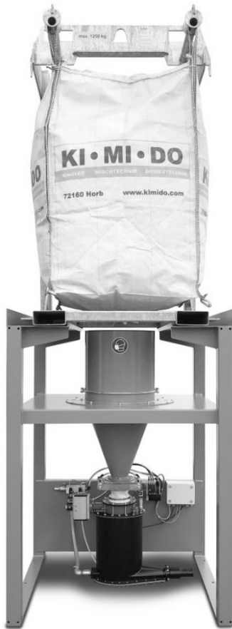
Big-Bag-Förderstation BF 1500