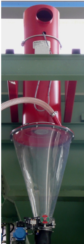
Pigment storage pod size VII 7.5 m 2 , V= 100 l