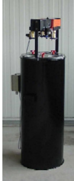
Fig.: Mixer mounted dust collector size. V 7.5 m 2