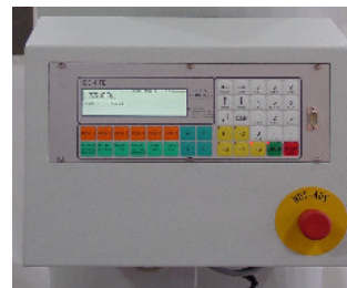
Fig.: Control system dosing machine

Length of the fibres between 6-30 mm (we also test other fibres on our machine)