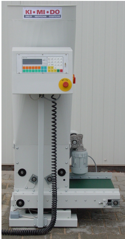
Fig.: Dosing machine for fibres F-4R/400