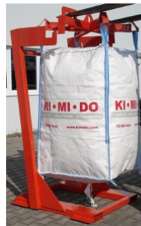
Big-Bag-steel rack with lifting hook