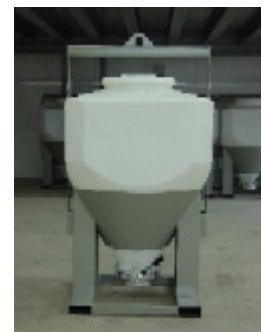
Changeable PVC-silo 1,2 m 3