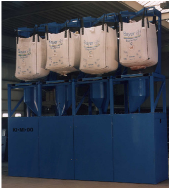
Fig.: FD 4 G