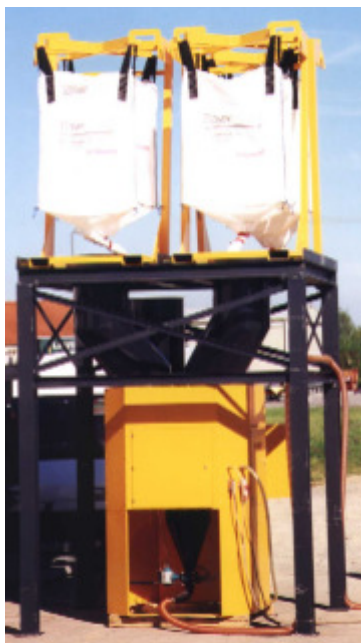
Subject to change without prior notice!