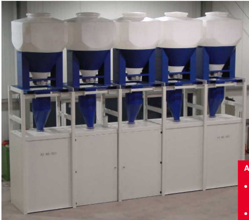
Fig.: FD 5 DS with special equipment PVC-silos 1,2 m³