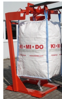
Big-Bag-steel rack with lifting hooks